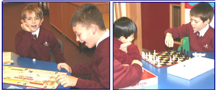
Pictured above: Children in the Wednesday Board Games Club enjoying the highs and lows of a friendly challenge!